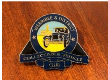
Small Hat Badge $5