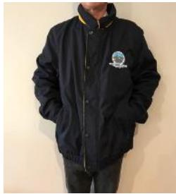
Winter Jacket $55