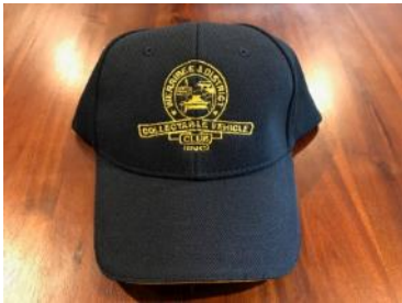
Club Cap $12