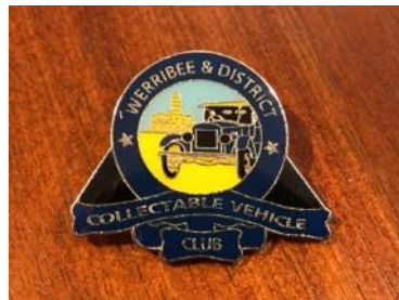
Small Hat Badge $5