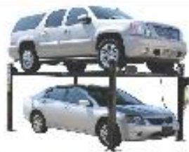
4 POST PARKING HOIST TL3.6PH-S 3.6 TON/3600 KG CAPACITY