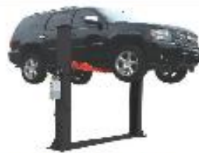
2 POST BASEPLATE TL4.0BP 4 TON/4000 KG CAPACITY