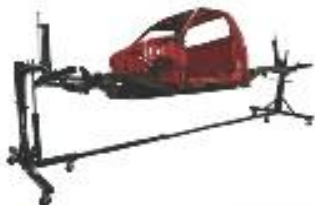
CAR ROTISSERIE TL1.3ROT 1.3 TON/1300 KG CAPACITY