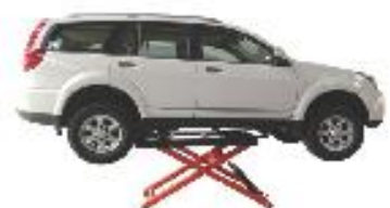
COMPACT SCISSOR LIFT EE-TS6600 2.7 TON/2700 KG CAPACITY