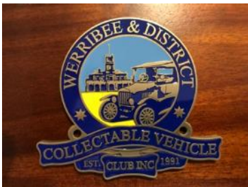
Metal Grille Badge $40