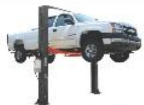
2 POST CLEAR FLOOR TL4.00HDI 4 TON/4000 KG CAPACITY