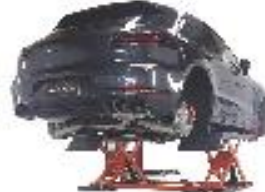
MID RISE SCISSOR LIFT EE-MR35 3.5 TON/3500 KG CAPACITY