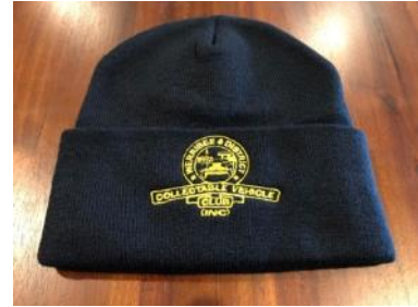
Club Beanie $12