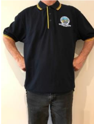
Club Polo $30