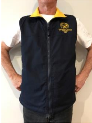
Club Vest $45