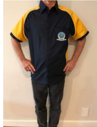
Summer Shirt $50