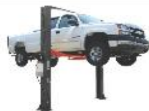
2 POST CLEAR FLOOR TL4.00HDI 4 TON/4000 KG CAPACITY