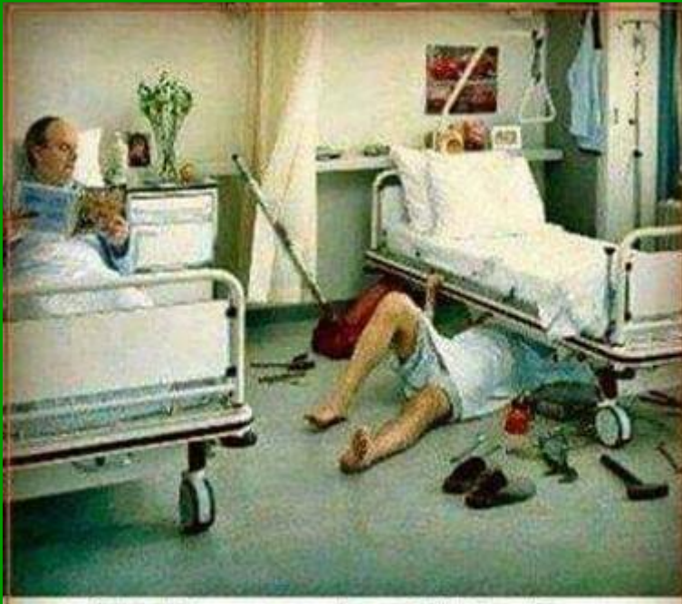
What happens when Old Car Guys get sent to the Nursing Home