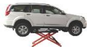
COMPACT SCISSOR LIFT EE-TS6600 2.7 TON/2700 KG CAPACITY